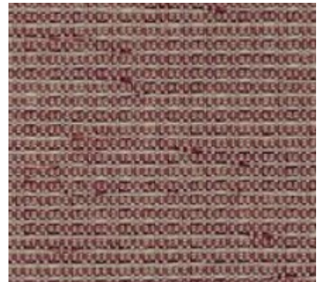
Acoustical Performance for Panel Applications (ISO 10534-2)

This is a directional fabric. Proudly woven in the USA supporting our local communities. Application testing of this product is recommended.